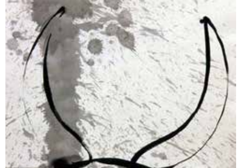
A Glimpse of the Ox