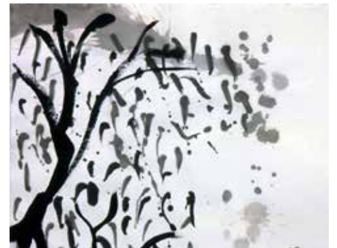
Going Back to the Beginning