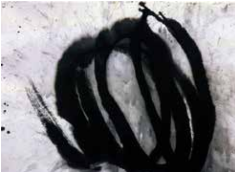
Catching the Ox