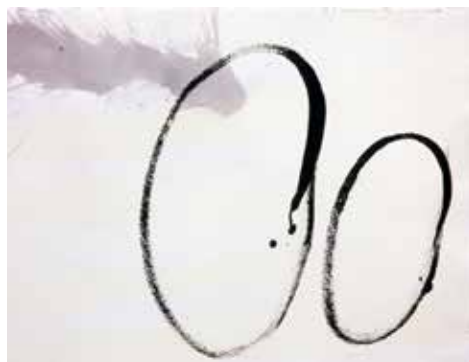
Entering the Marketplace