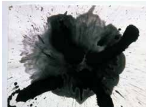
Taming the Ox