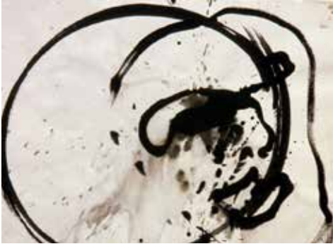
Searching for the Ox