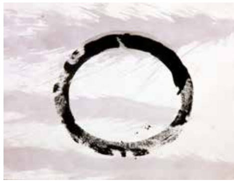
Self and Ox Forgotten