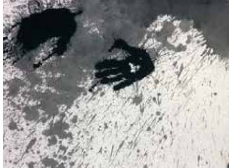
Seeing the Traces